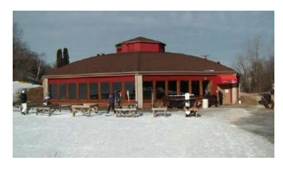
50% Indoor Capacity

The Chalet will be open to bathrooms and to get food to go.